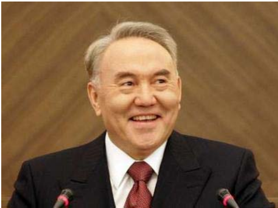
Nursultan Nazarbayev: Engineer of Regional Integration?

rather than partners in the international market. In many cases, these states prioritize their ties with non-regional countries as more important for developing their economies than the expansion of economic and trade ties within the region. Accordingly, frontiers are being fortified to protect individual markets from neighboring states. The outcome of such policy is a 'lose-lose' situation for all.