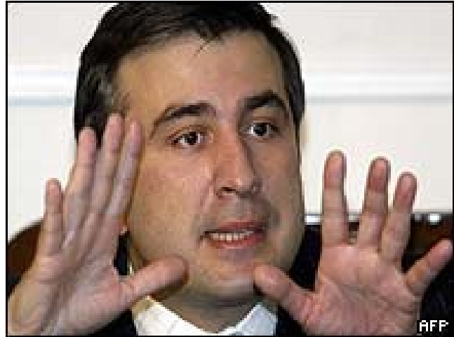
Saakashvili – under Pressure?

money transfers violates International Monetary Fund regulations; transfers are often made through non-Russian companies such as Western Union; and Georgians in Russia might be driven to bypass such regulations anyway by wiring money through other states such as Armenia or Ukraine.