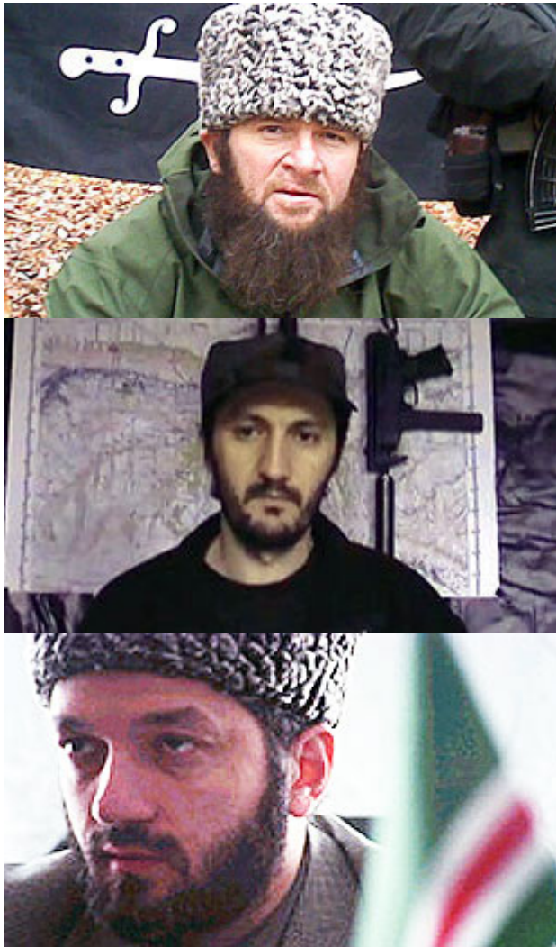
Doku Umarov, Anzor Astemirov, Movladi Udugov.

Historically, Russia has shown itself adept at forging auspicious diplomatic relations with neighbouring Islamic regimes, particularly