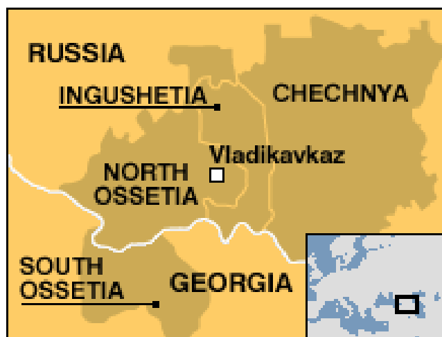
Map of North and South Ossetia (BBC)

objective. Publicizing the arrest of uranium smugglers operating in the breakaway regions supports the Georgian argument that neither the local authorities nor Russian peacekeepers have proven able to secure the territories from serious nonproliferation threats and dangerous criminal networks.