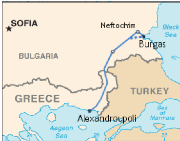
Proposed Pipeline Route

European sponsored BTC project and the developing gas pipeline from Baku to Erzurum in Turkey, and has moved to minimize the damage to its interests by getting its pipeline in first. Since Greece and Bulgaria benefit greatly from the new pipeline and the possibilities for economic stimulation that it offers them, it is not surprising that they finally accepted this program. But the reasons for the new urgency behind Moscow's