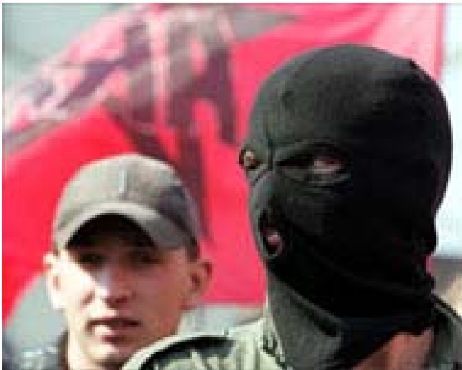
A Russian Extreme-Rightist

The proponents of the Eurasian model emphasize that the people of Russia/Eurasia constitute a quasi-nation due to historical tradition and a common geopolitical space. But the notion of “Rossiiane” has started to be challenged by various forms of Russian nationalism. One form, supported by an increasingly assertive Russian middle class, implies that Russia is a state of ethnic Russians, not of “Rossiiane” consisting of various ethnic origins. Ethnic Russians, in this view, should maintain a dominant position over the minorities.