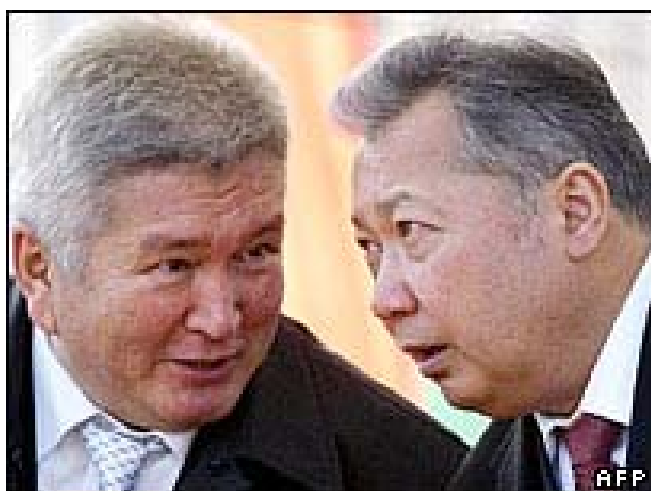
Bakiyev and Kulov: Seeing Eye to Eye?

any further signs of unrest or so called color revolutions in Central Asia generally. And Russia has steadily increased the scope of its air base at Kant, making it a centerpiece of its regional military presence. But the more money it commits to stabilizing the situation in Kyrgyzstan, the more implicated it becomes in the success or failure of the regime which, despite Russian help, is no more secure than before. Yet Kyrgyz observers agree that Russian economic power is insufficient to truly retrieve the situation in Kyrgyzstan.