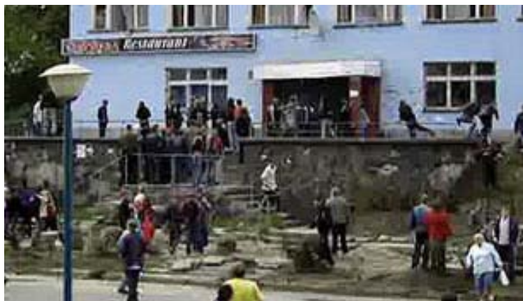
The Kondopoga Riots

By the end of the Yeltsin and especially the beginning of the Putin era, the ruling elite had actually