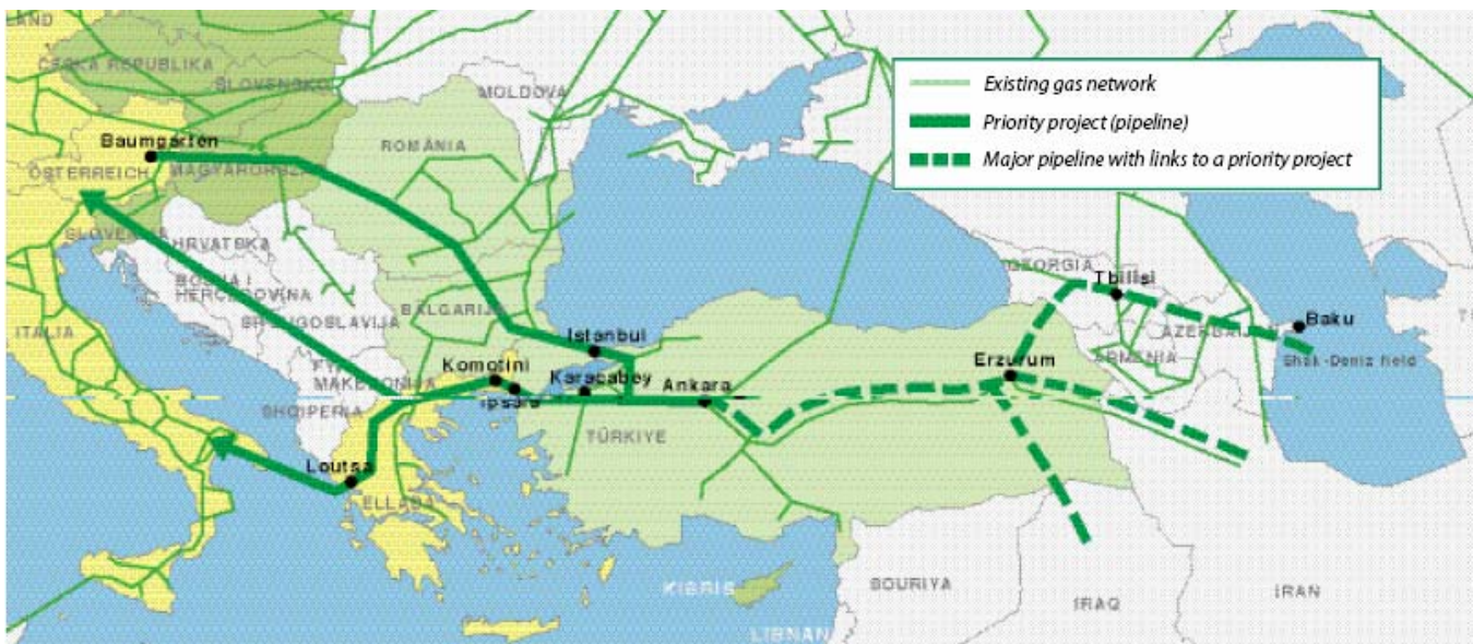
Nabucco Pipeline Project (European Union Map)

Two gas pipelines currently run from Russia to Turkey: the eastern branch of the Trans-Balkan Pipeline, which reaches Turkey via Bulgaria, and Blue Stream, which runs from Isobilnoye, Russia to the Black Sea port of Dzhughba, then underwater to Samsun on the Turkish Black Sea coast. A