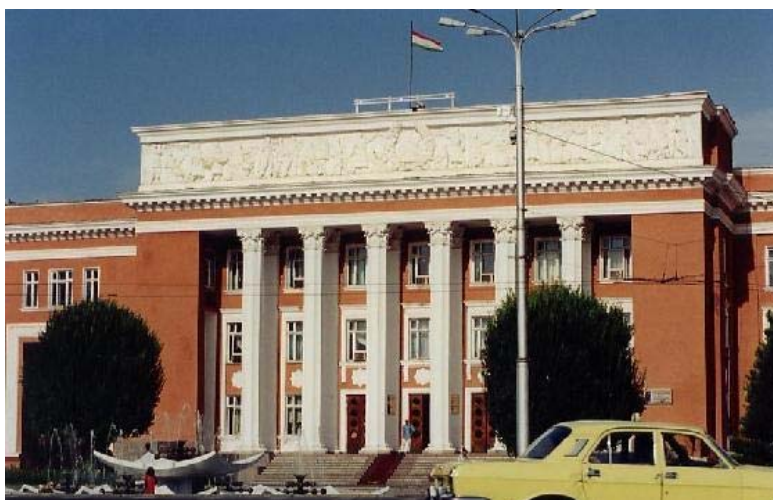
The Government Building in Dushanbe: Rakhmonov's to Keep?

Still, the government seems to be trying to make the